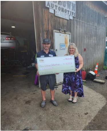
C. Brown Automotive

In addition to grant admin, the RRA will be providing support for the US4/US7 Intersection Study, Transit Oriented Development (TOD) Downtown Plan, and work on the Rutland City Capital Improvement Plan.