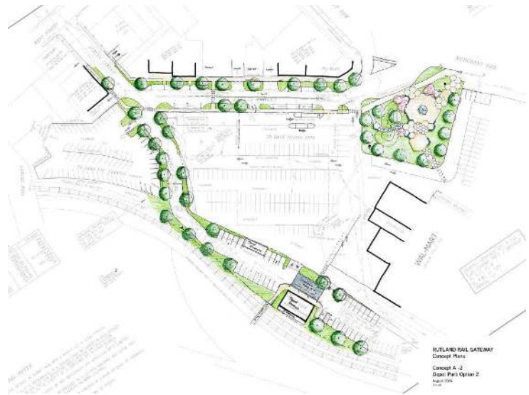
Rail Gateway Concept Plan