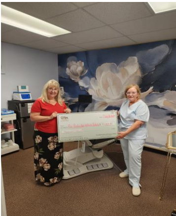
Pure Restorative Wellness